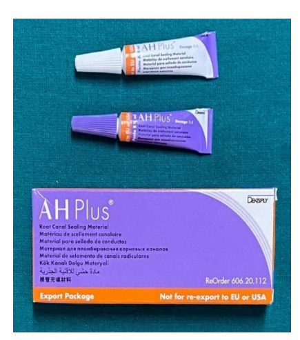
Fig1: AH Plus Root Canal Sealer

After drying with paper point, a small amount of sealer was introduced into canal with paper point. A gutta-percha point was adapted and canal was obturated by cold lateral condensation technique. The coronal cavity was sealed by direct composite restoration and post obturation RVG image was taken.