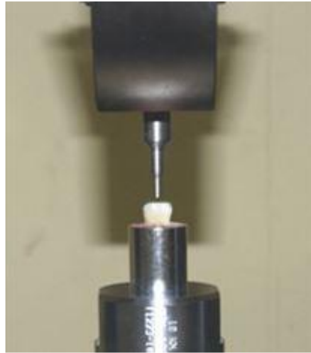
Sample Placed under Universal Testing Machine