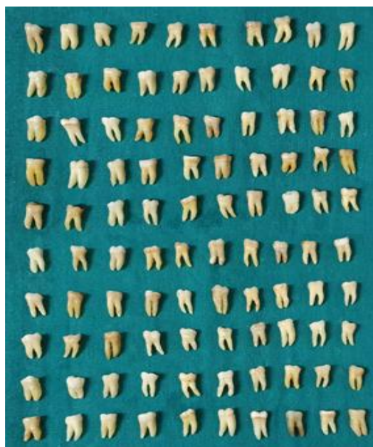
Photograph of the Specimen

This was a comparative experimental study, which involved 100 extracted teeth (Permanent mandibular first molars) consisting of positive and negative control groups, each with 20 samples.